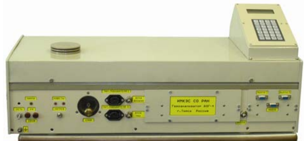
Fig. 2. External view of the gas analyzer DOG-4 for control the concentration of emissions of NO and SO 2 .

The test prototype of the gas analyzer operating in the IR range is made for control the carbon monoxide content in smoke emissions. 25