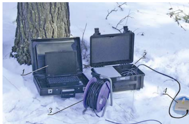
Fig. 4. Multichannel recorder MGR-01 at field tests: 1 is the notebook for fixation of results; 2 is the packing case with recording unit; 3 is the supply cable coil; 4 is the external antenna unit.

To record these pulses, the multichannel geophysical recorder MGR-01 was constructed. It represents a set of sensors of NPEMEF electric and magnetic components joined into the antenna unit and recording unit (Fig. 4).