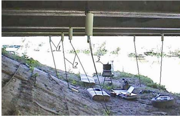
Fig. 5. Arrangement of the «Phase» system under the bridge span: 1 the acoustic sensors; 2 the tension members; 3 the notebook.

and air flow displacement on measuring results. 30 The sensors are arranged at tension members so that the acoustic radiator is rigidly attached to the construction and the receiver – to the ground (Fig. 5).