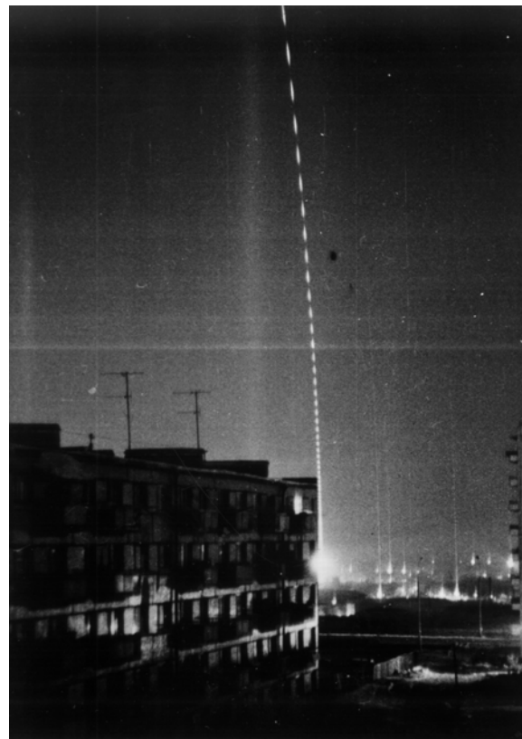
Fig. 1. Stratified halo.

snow-covered frozen ground, i.e., the dielectric with losses; and the dielectric is inhomogeneous along the wave vector. Therefore, when reflecting, phase shifts can depend on the frequency, and there can appear conditions for origination of wave packets at different moments and in different spatial intervals. This forms the "running striations phenomenon."