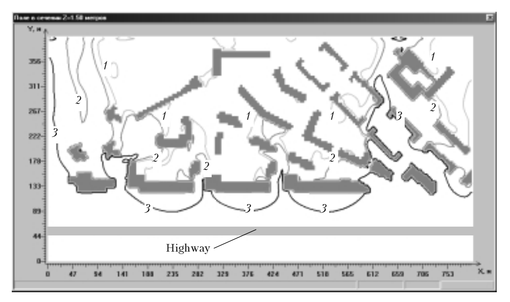
Fig. 1. Nitrogen dioxide concentration fields in the case of highway without protective shield. Isolines 1 , 2 , and 3 correspond to the concentration of 0.5, 1, and 2 MPC.

The second calculation series with allowance for buildings but without the protective shield showed the tendency toward decreasing of the pollution at the height of 1.5 m. The pollution zones decrease due to vertical redistribution of nitrogen dioxide. The values exceeding 2 MPC are observed only near buildings from the direction of the highway. Insignificant penetration of harmful (exceeding 1 MPC) pollutants inside the microdistrict occurs only in interbuilding and arch spaces of multistorey (9–12 stores) buildings staying along the highway. Significant penetration of pollutants in depth of the microdistrict is observed only in the area of low (2–3 stores) buildings and along the access railroad, where the concentrations achieve 1-2 MPC. Figure 1 depicts the nitrogen dioxide concentration at the height of 1.5 m calculated for this case.